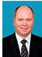
Minister of Finance Eero Heinäluoma