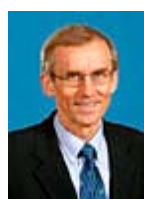
Minister of Education Antti Kalliomäki