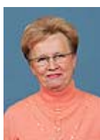
Coordinate Minister for Finance Ulla-Maj Wideroos