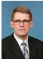
Prime Minister Matti Vanhanen

This sub-section introduces the Ministers of the Finnish Government. Photographs of the Ministers for editorial use can be found in the photo archive under Media Services.