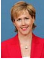
Minister of Social Affairs and Health Tuula Haatainen