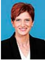
Minister of Transport and Communications Susanna Huovinen