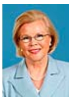
Minister of Justice Leena Luhtanen