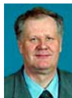
Minister of Defence Seppo Kääriäinen