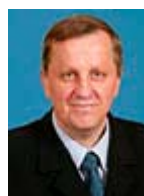
Minister of Agriculture and Forestry Juha Korkeaoja