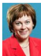
Minister for Foreign Trade and Development Paula Lehtomäki