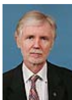
Minister for Foreign Affairs Erkki Tuomioja