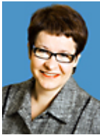
Minister of Labour Tarja Filatov