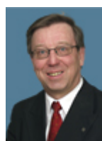
Minister of the Interior Kari Rajamäki