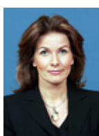
Minister of Culture Tanja Saarela