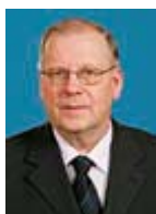
Minister of Regional and Municipal Affairs Hannes Manninen